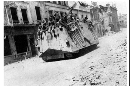
A7V tank at Roye