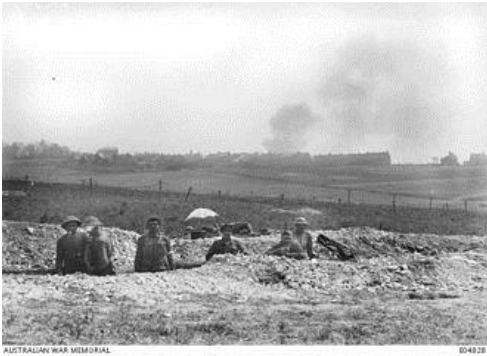
Australian troops near Villers-Bretonneux, 2 May 1918

In late March 1918, the German army advanced towards the vital rail-head at Amiens, pushing the British line back towards the town of Villers-Bretonneux. In response to the Germans' early advances during the offensive, on 29 March the 9th Australian Brigade, consisting of four infantry battalions, had been detached from the 3rd Australian Division and sent south from Belgium to help prevent a breach of the line between the British Fifth Army (General Hubert Gough) and the French First Army (General Marie-Eugène Debeney) that was positioned to the south.