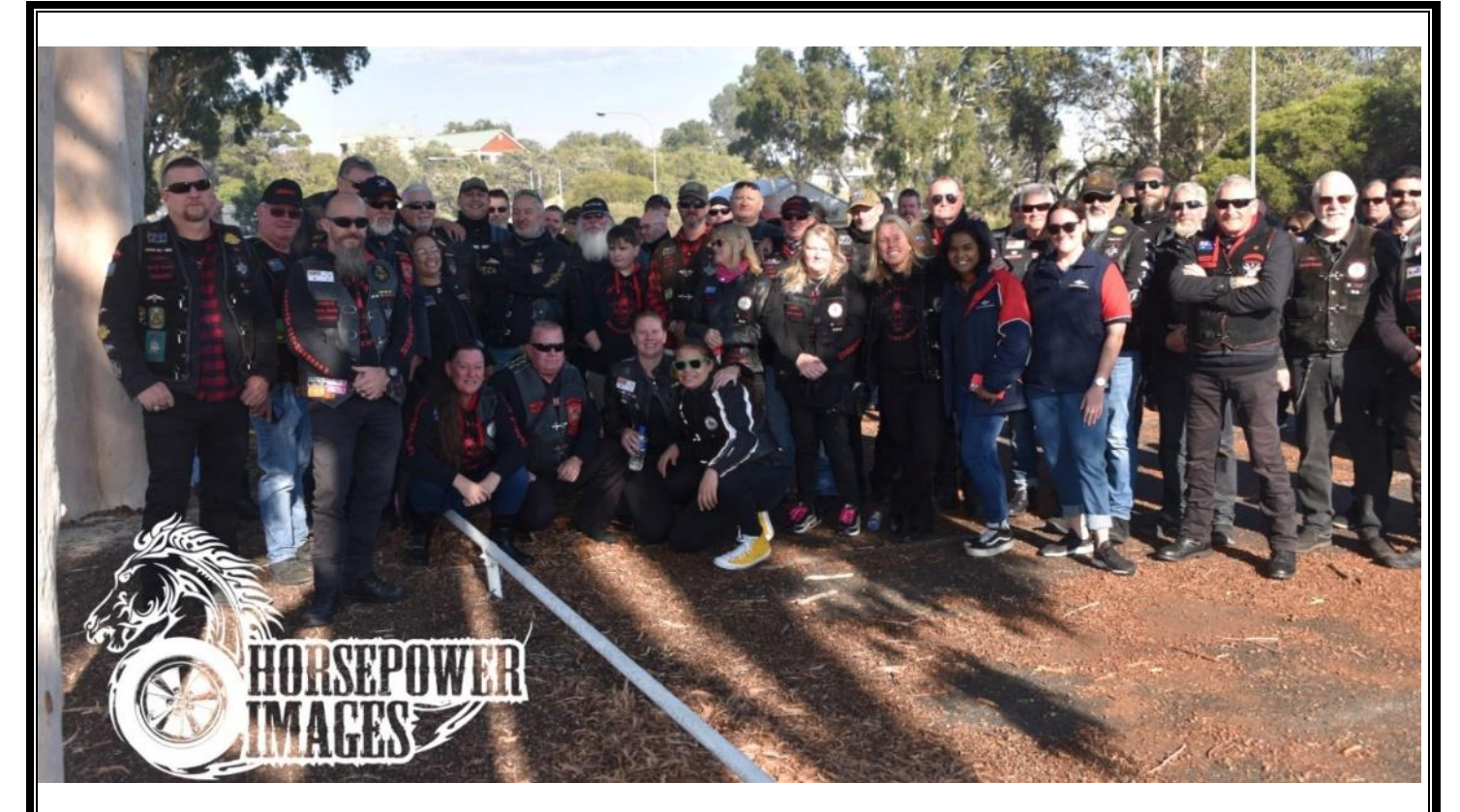
Our motto is "The Task is Ours" Military Brotherhood MMC Perth South