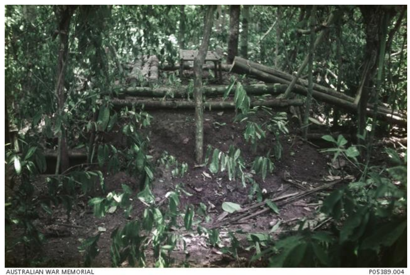
A typical enemy bunker encountered by the Australians on Operation Overlord. Most were very stoutly constructed and well concealed

In the initial burst of fire the platoon took a few casualties, the most serious being Private Mitchell who was shot through the throat. The platoon deployed; we realised that we were in deep poo. The platoon was receiving fire from the front as well as from the flanks (English, p. 33).