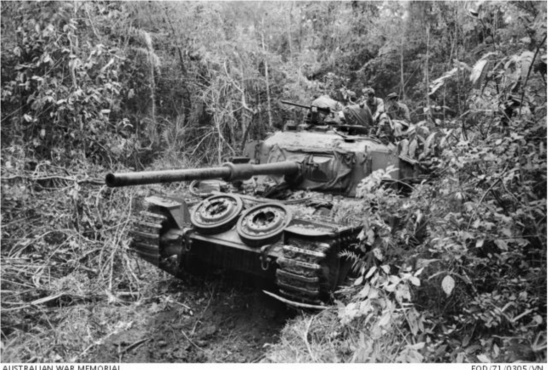
A Centurion tank of C Squadron, 1st Armoured Regiment moving through the jungle on Operation Overlord, June 1971.

On 5 June the Australians deployed by helicopter and armoured personnel carriers north to the province border of Phuoc Tuy, near the Courtenay Rubber Plantation. 3rd Battalion, The Royal Australian Regiment (3RAR) would take the lead in assaulting enemy positions, while 4RAR/NZ and American troops held blocking positions to trap enemy forces looking to escape. Australian armoured personnel carriers (APCs) from 3 Cavalry Regiment, tanks from 1 Armoured Regiment, artillery from 12 Field Regiment and sappers from 1 Field Squadron would also be in support.