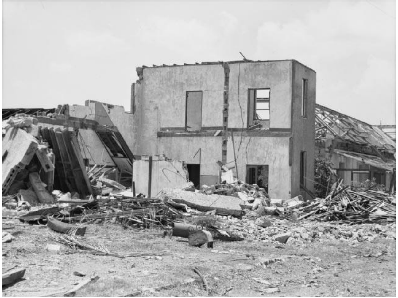
The customs house at Darwin after being hit by several bombs during the Japanese air raid in February 1942

The Japanese did not invade, but they did bomb Darwin another 63 times during the war as well as other towns in northern Australia.