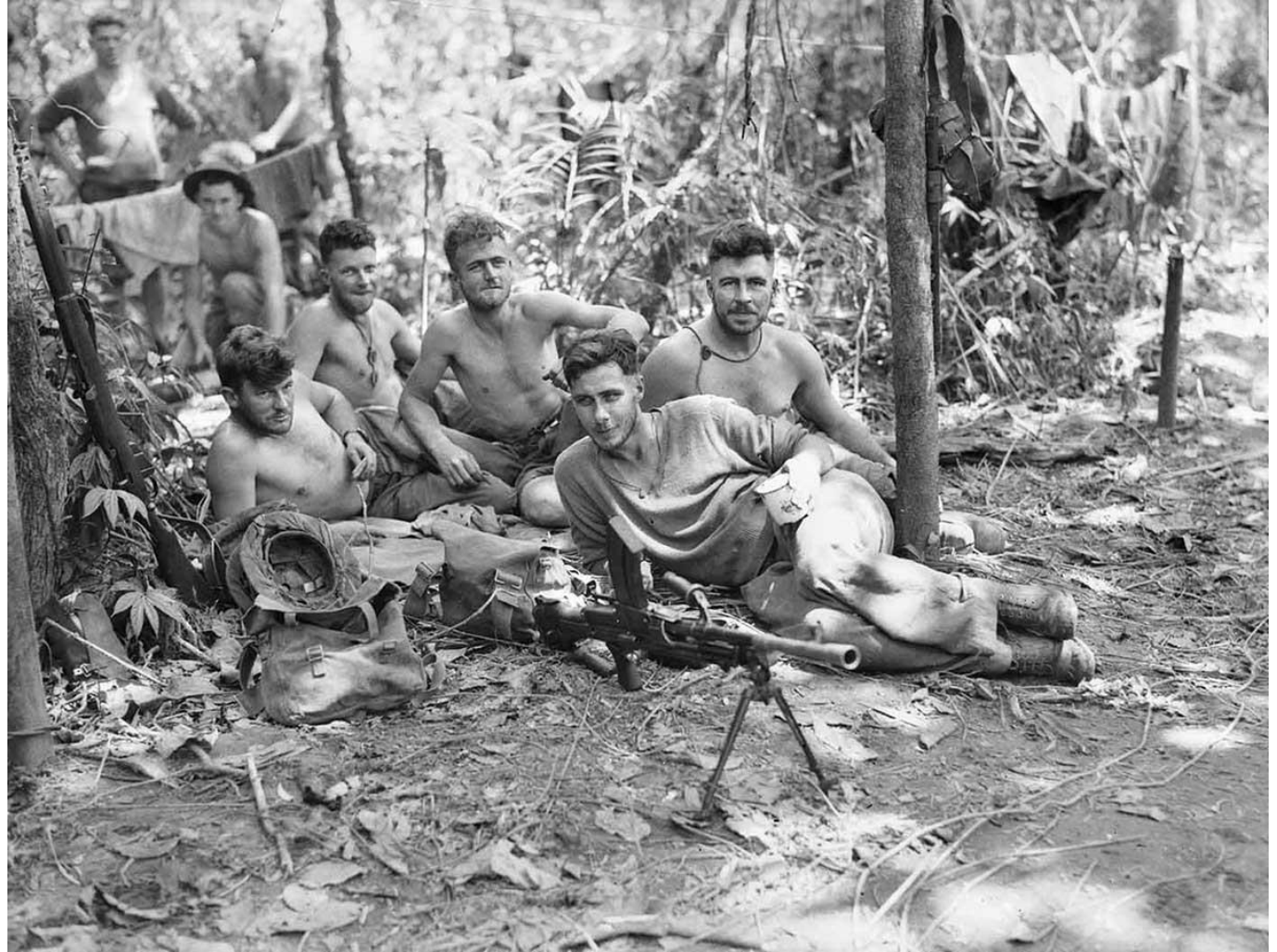
Men of the 2/31st Australian Infantry Battalion stop for a rest in the jungle between Nauro and Menari, Papua New Guinea. 1942

1942: Japanese bomb Darwin but are halted on Kokoda Trail