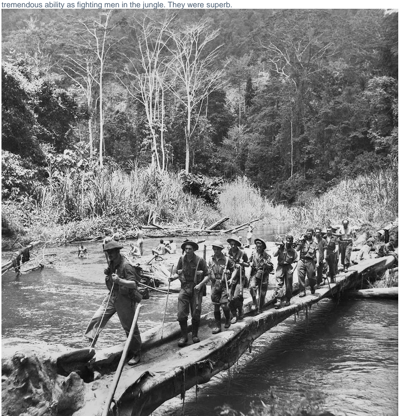
A patrol of 2/25 and 2/33 Australian Infantry battalions crossing Brown's River

In the Kokoda battle, [the Australian soldiers'] qualities of adaptability and individual initiative enabled them to show